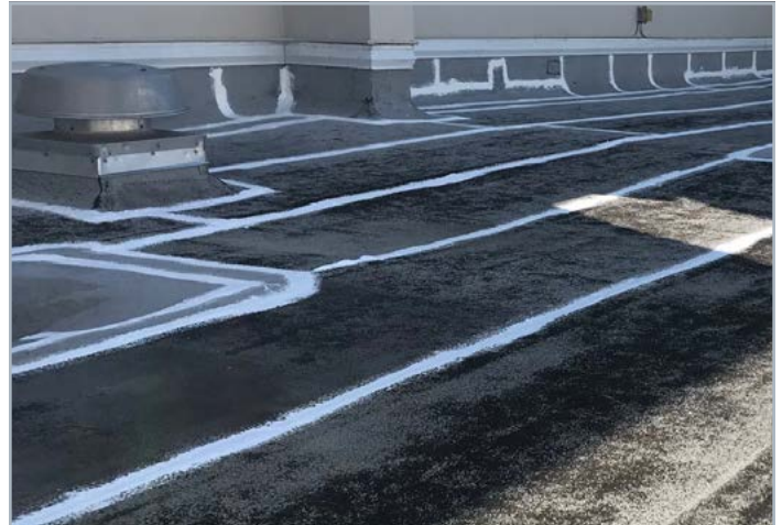
2. SEAL AND REINFORCE around penetrations and flashings.