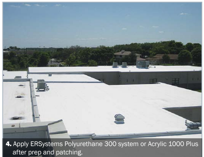
4. Apply ERSystems Polyurethane 300 system or Acrylic 1000 Plus after prep and patching.