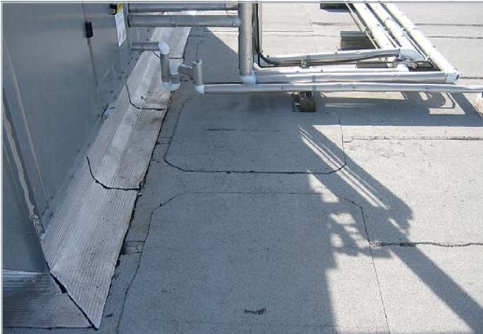
1. Repair and replace any deteriorated areas with LIKE MATERIALS to make WATERTIGHT .